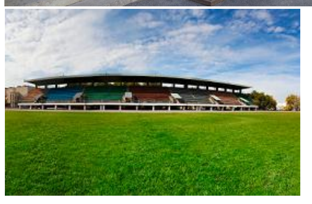
Summer school Al-Farabi Kazakh National University Almaty, 26-30 of April 2021